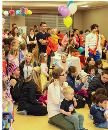
Royal Sing-Along event in White Fish Bay